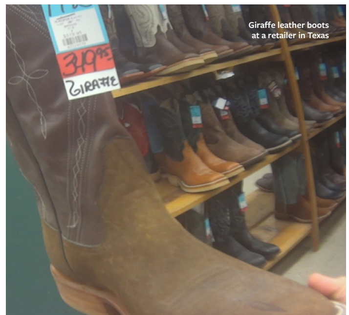
Giraffe leather boots at a retailer in Texas

Society of the United States, the Center for Biological Diversity, the International Fund for Animal Welfare and the Natural Resources Defense Council submitted a petition to the U.S. Fish and Wildlife Service to list the giraffe as endangered under the U.S. Endangered Species Act. Analysis of giraffe trade into the U.S. conducted as part of this petition revealed that nearly 40,000 giraffe parts and products had been imported into the U.S. over the last decade. These parts are thought to represent nearly 4,000 individual giraffes, indicating that the U.S. is a substantial market for trade in giraffes. An endangered listing would effectively prohibit the import, export and interstate trade in giraffes, providing much-needed protection for this declining species. The USFWS has yet to respond to the joint petition.