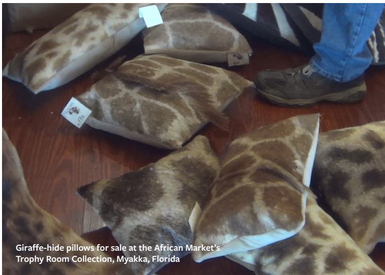
Giraffe-hide pillows for sale at the African Market's Trophy Room Collection, Myakka, Florida